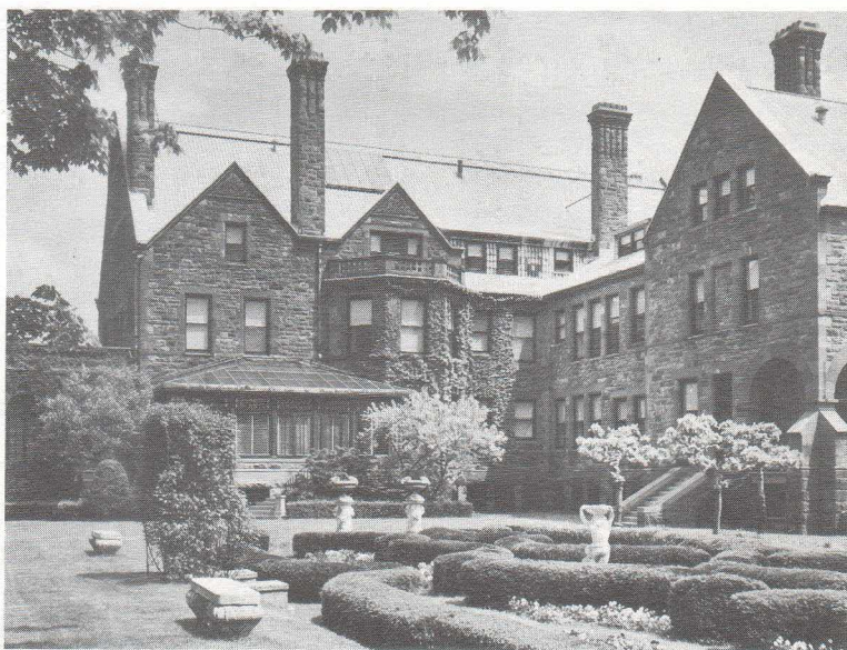
LONGYEAR FOUNDATION from a rear formal garden

There are manuscripts, solicited by Mrs. Longyear, from loyal students who had been closely associated with Mrs. Eddy, giving valuable evidence of Mrs. Eddy's daily activities and her manner of working. Portraits of many early workers who had loyally assisted her in various capacities fill the galleries — some portraits commissioned by Mrs. Longyear, others given by asso-