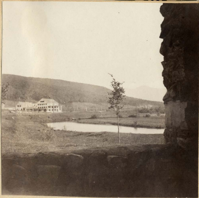
White Mountain House from the church